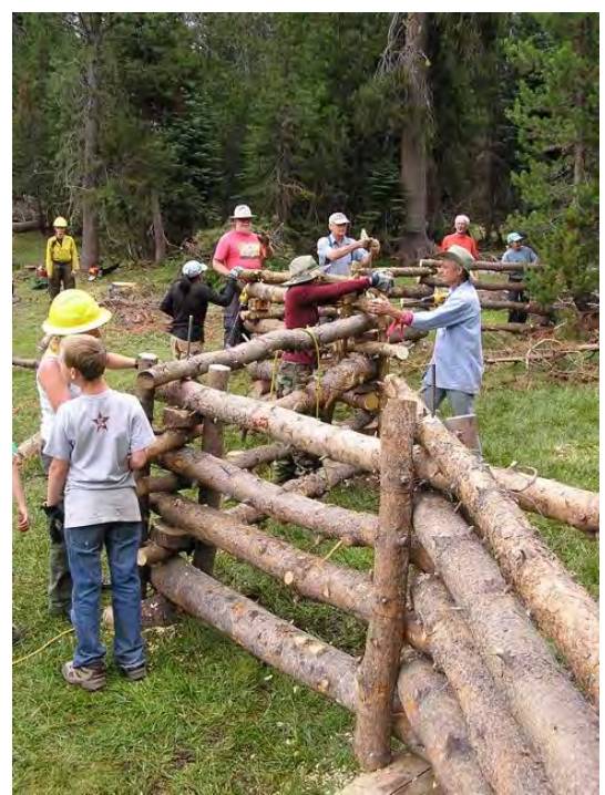
At left: CSERC volunteers building the fence around the fen in Sapps Meadow in 2010.

CSERC replaced logs and re-wired several sections of a 1+ acre split-rail wooden fence that CSERC volunteers built a few years ago to protect rare plants and sensitive wetland habitat.