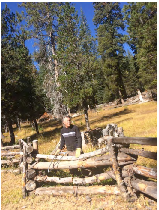
In 2016, the fence that took so many projects to build is holding up well, but a few logs needed reinforcement or replacement.