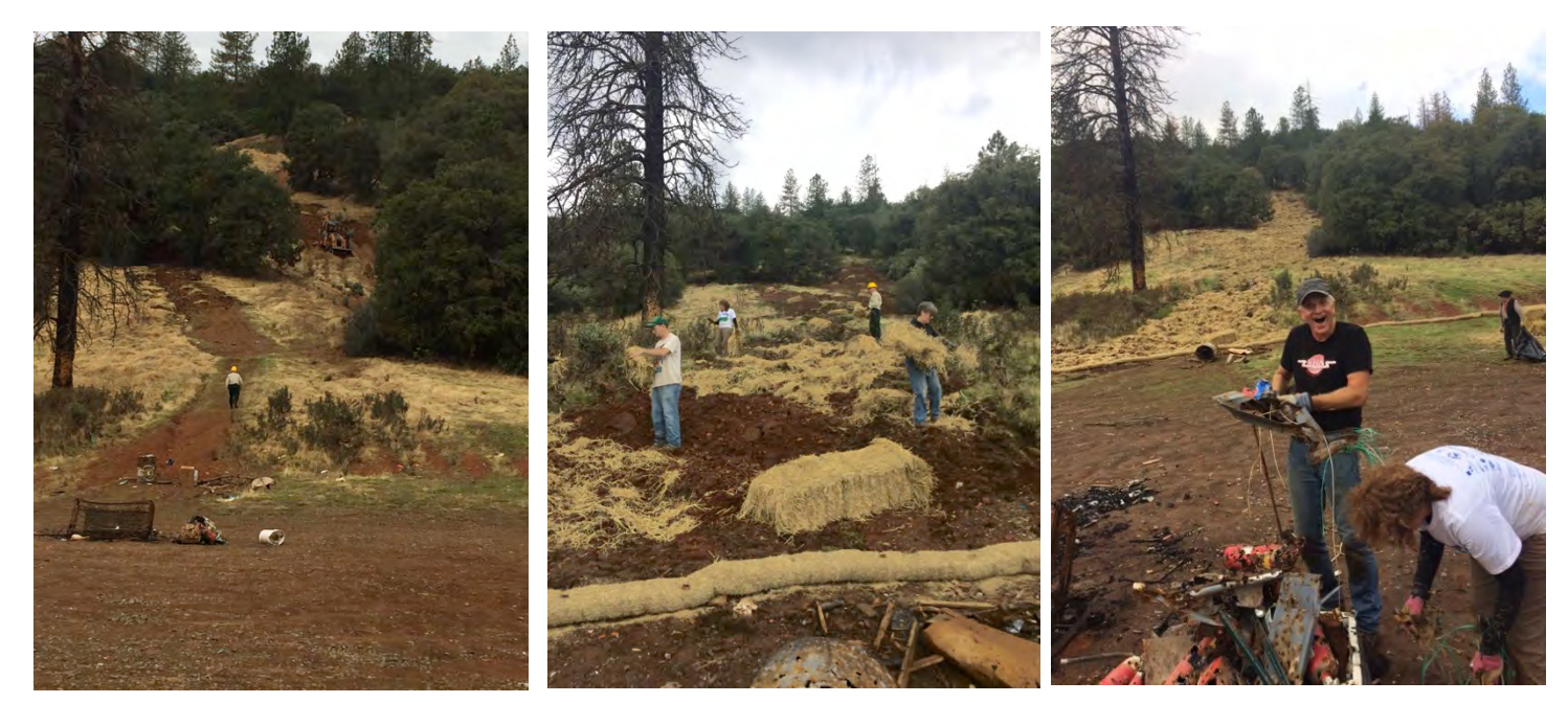
BeforeDuringAfterThe hill climb slowly disappeared under dozens of bales of rice straw spread out by our volunteers.

At this productive workday, volunteers blocked over 3/4 miles of unauthorized motorcycle hill climbs with debris, spread erosion control rice straw, and installed straw wattles/silt fence as needed. They also picked up hundreds of pounds of trash from dispersed recreation users, especially target-shooting trash (targets and gun shells).