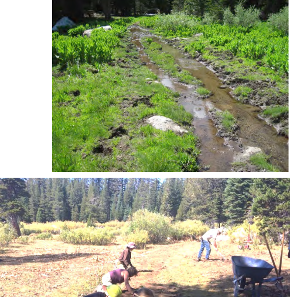
Photo at left shows the trail in Coyote Meadow pre-restoration. Note the stream that is diverted into the trail, and the braiding and trail widening that was resulting from horses and people trying to avoid the water.

This meadow had severe hydrology problems due to a poorly placed trail that was diverting a creek out of its channel and into the trail bed causing mud pits, trail braiding, and more. The rare Yosemite toad was also being affected by the water diversion. The trail crew for the forest had re-routed the trail to bypass the meadow. CSERC volunteers naturalized the former trail in the meadow and restored the soil by digging up the trail and replanting the path with sod to revegetate it.