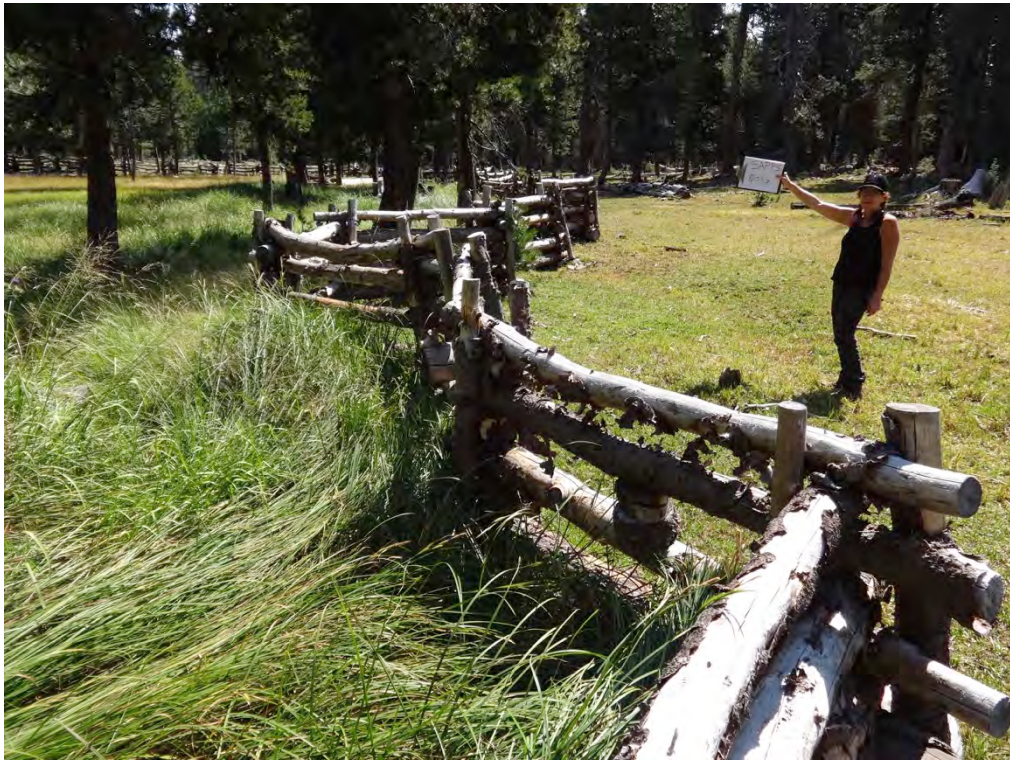
Summer 2016: The difference between the meadow and fen habitat that is protected from livestock grazing and pocking at Sapps Meadow by the fence CSERC volunteers built, is drastic.